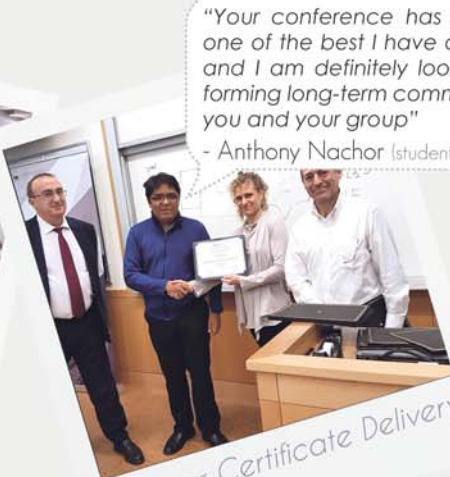
Seminar Certificate Delivery

"Your conference has gone down as one of the best I have attended so far, and I am definitely looking forward to forming long-term communications with you and your group"